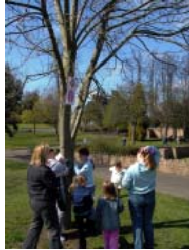
I haven't a clue