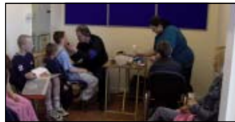
Face Painting was popular, as the queue shows