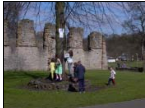
Up a gum tree